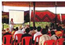
Workshop on Veda & Integral Life

various subjects of Veda published by us have drawn the attention of wider public. New books are being continuously added. Till Feb 2005, We have published 60 titles.