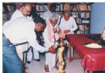
Inauguration of Vedic Library

Our books giving the highlights of Rig Veda on various topics relevant to the modern age such as 'Why Read Rig Veda' have been well received. Small booklets covering